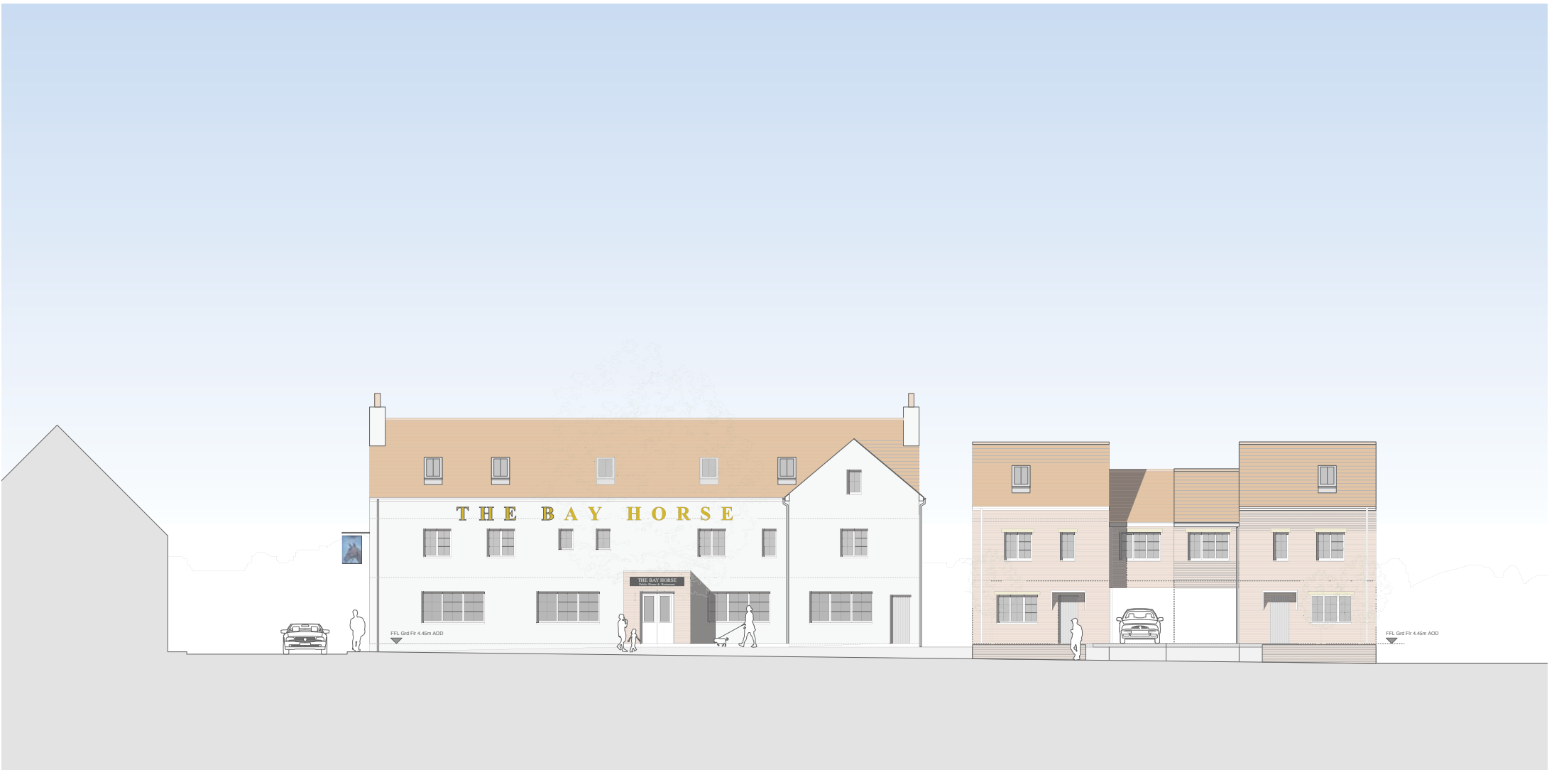
South-West Elevation - Pub and Houses