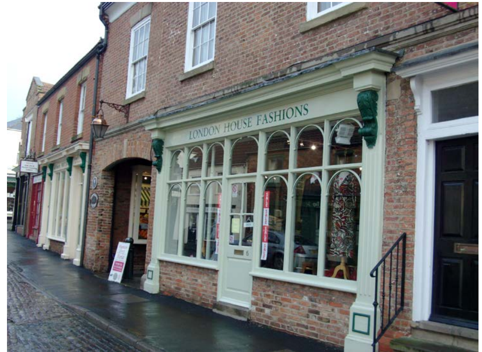
Figure 11: The successful application of heritage colours to a shop front - The use of two colours is successful but any more would be garish.

Modern colours can look harsh and should be avoided. Colour schemes adopted should be subtle and blend with the areas historic environment. Rich dark colours can look good. Pale colours or off-white, which were traditionally used on shop fronts, are also fitting. The use of one or two colours is ideal, any more and the result would be garish and confusing to the eye. It is important to consider the colour schemes of neighbouring properties to avoid unsympathetic clashes.