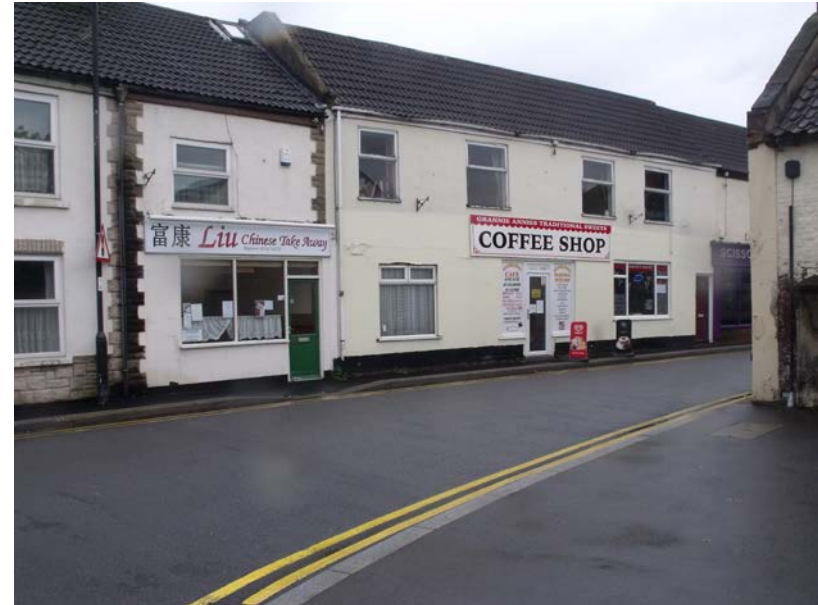
Figure 4: There has been no design consideration with the conservation area and the character of the traditional buildings. Fascia height is disproportionate

relate to the fascia height of the adjacent properties. If buildings differ in size or architectural style, varied designs are more likely to be appropriate and variation in the height of fascias will maintain the rhythm of the buildings.