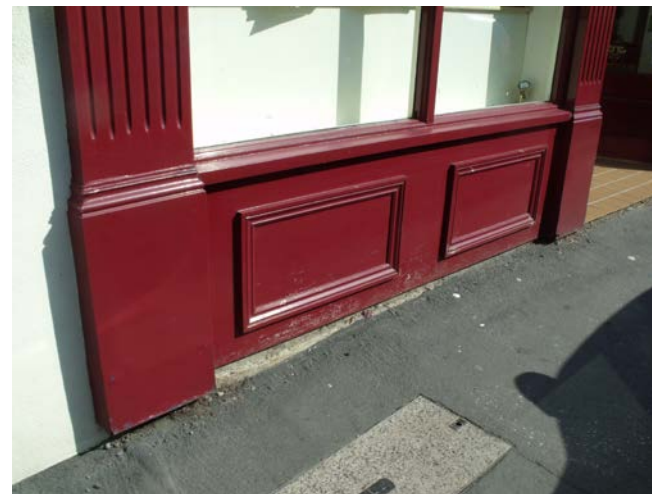
Figure 9: Stallriser with fielded panels

The stallriser is an important component of a shop front and should be an integral part of the design. It gives protection to the base of the shop window and provides the building with a visual anchor to the ground. They should be constructed in substantial and hardwearing materials, with panelled painted timber, brick, stone or rendering preferred. Where Victorian glazed tiles survive these should be retained. It is often possible to unify the façade by using the facing material of the upper floors in the construction of the stallriser.