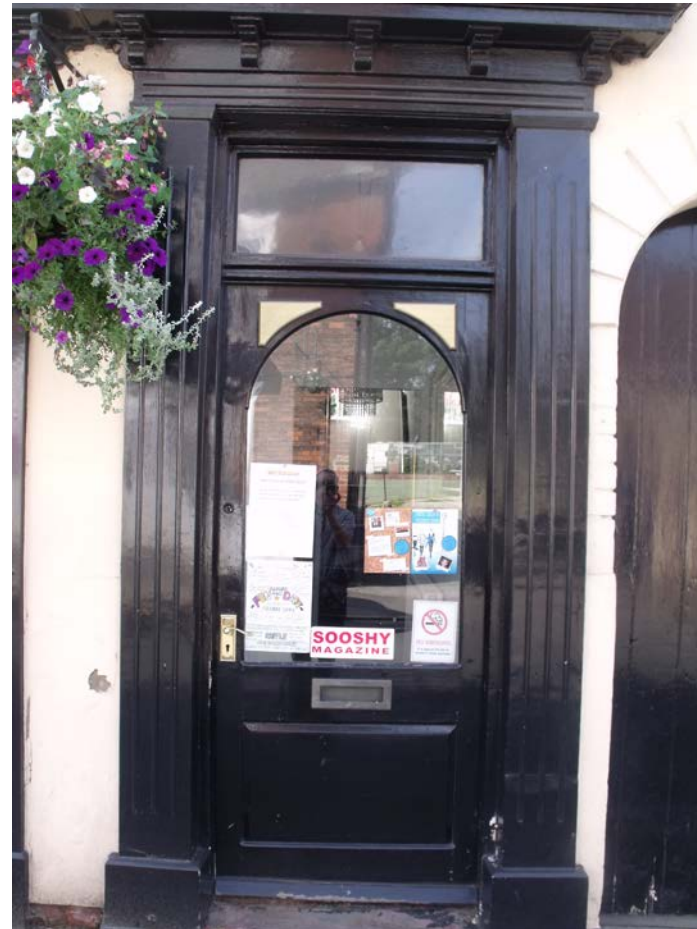
Figure 10 Traditional shopfront door with pilasters

The bottom panel should be of a height to match the stallriser and the door should usually be constructed in the same material as the frame.