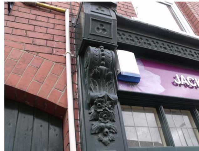
Figure 7: Ornate Victorian console bracket

Consoles are a feature of Victorian style shop fronts and comprise an elaborate bracket formed to the head (capital) of the pilaster. It is