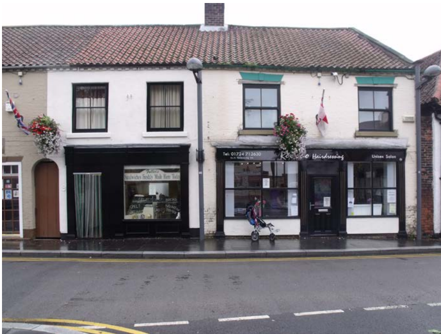
Figure 3 These shopfronts are better designed for the conservation area and the front elevation of the buildings