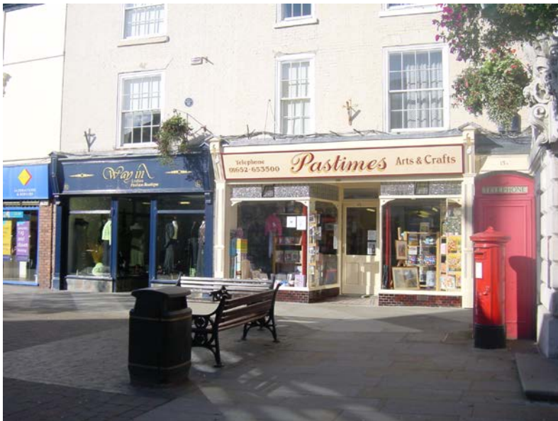
Figure 6: Well-detailed fascia and signage.

Projecting rectangular box sections should be avoided as they look bulky and cumbersome but the fascia can be angled forward. The fascia should be finished with a cornice to the top, with a smaller moulding to the bottom. If the fascia and cornice is not enclosed between consoles, or recessed into an opening, then their profile should be maintained around the returns at each end.