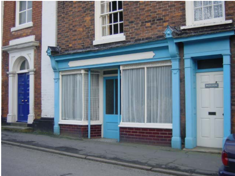
Figure 1: Example of a 19th century shop front style

It is generally accepted that historic towns with attractive, locally distinctive and well-maintained shopping centres have a better prospect of retaining and improving their economic well being. Poorly designed and badly maintained shop fronts tend to create a run down appearance of not just the individual building, but also the streetscape as a whole. This can have a negative effect on the vitality of the area in general. Good shop front design is a prerequisite to the visiting public's perception of the character, vitality, and economic health of an area.