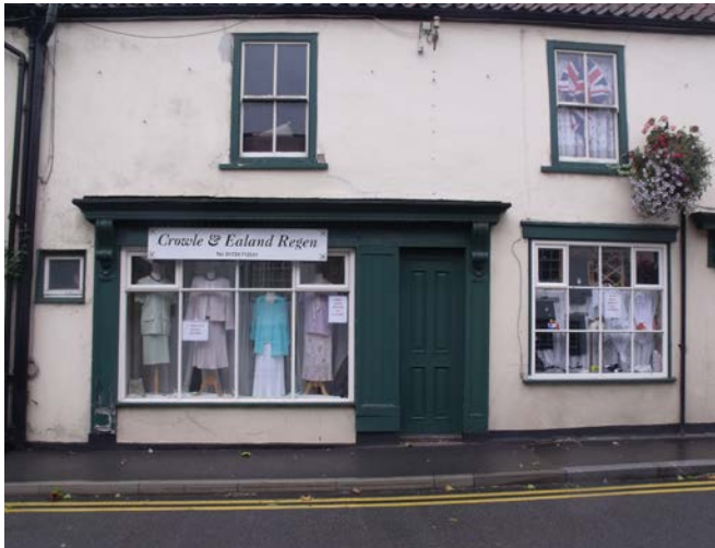
Figure 5 This shopfront has been built in timber and is in character with the traditional building and the conservation area.

The materials should be selected in keeping with the character of the building and streetscape and in accordance with the shop front style used. Timber is generally the most appropriate but this can demand a high standard of craftsmanship. Other traditional materials of good quality can also be considered. For example, stone, brick, tiles and metalwork. However, timber is the predominant material used for the construction of shop fronts in the North Lincolnshire Market Towns.