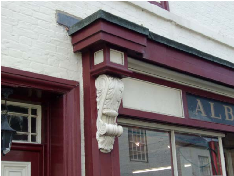
Figure 8: Traditional cornice

The cornice provides a break between the shop front and the building façade and a natural overhang to the fascia, thus shedding water and reducing the risk of decay. The cornice should be finished with a lead flashing, correctly detailed and installed by a recognised competent craftsman.