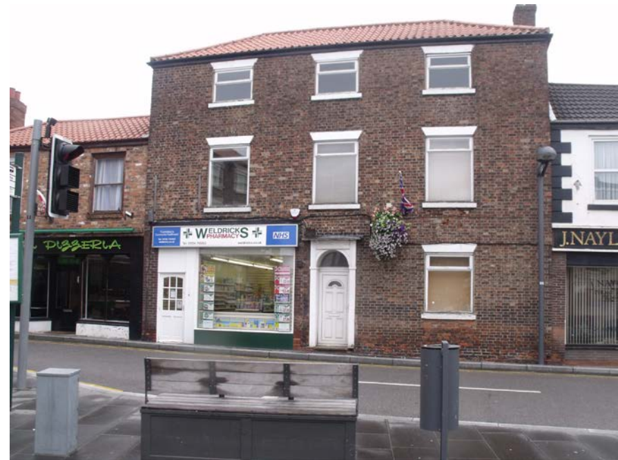
Figure 2: This modern shop front has no visual relationship with the upper floors.

Where there is an entrance to the upper floors on one side of the building, this may be integrated into the shop front design. The doors to the majority of Georgian buildings already have a strong identity and are framed with pilasters and pediment. This separate identity should be retained.