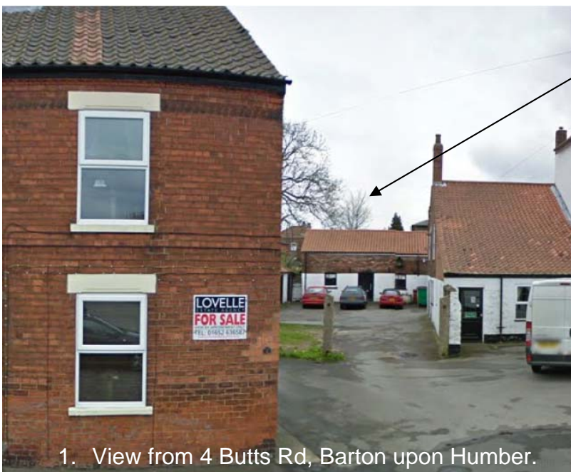
Subject tree – little significance on street scene

Regarding the visual amenity of the tree, as a generalisation, trees do add significantly to the heritage and street scene of localities. However in this case it is considered the tree has an extremely minimal impact . To appreciate this the images below show the street scene in the locality and of the tree in particular.