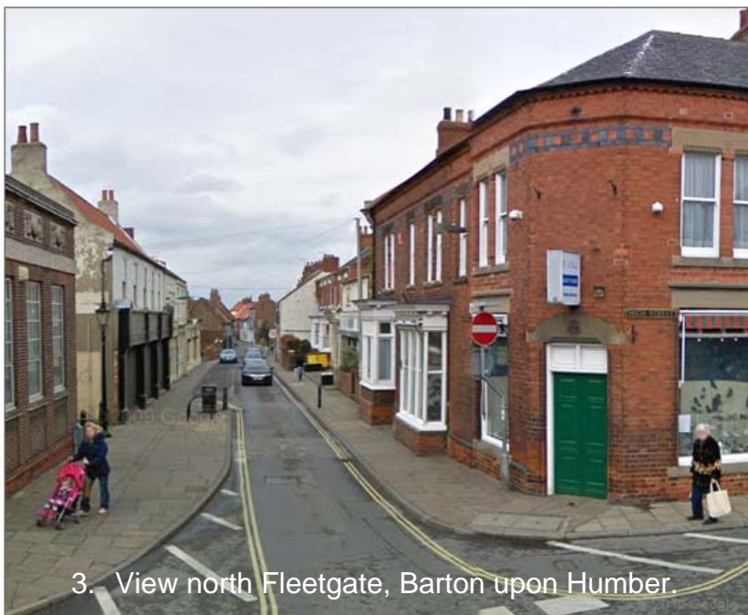
Image 3 is the view north along Fleetgate and shows the street scene is not characterised by trees. Also there is little opportunity to plant trees with two-storey buildings directly fronting onto the footway. The subject tree is neither visible from Fleetgate or the nearby Newport Street.

Image 2 shows trees already protected by a TPO which are arguably more significant and worthy of their protection.