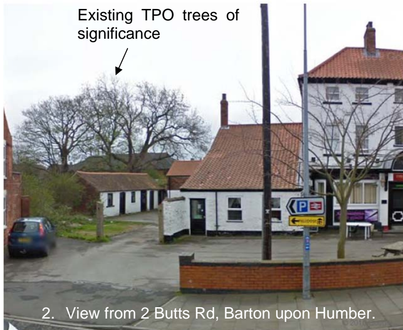
Image 2 shows trees already protected by a TPO which are arguably more significant and worthy of their protection.