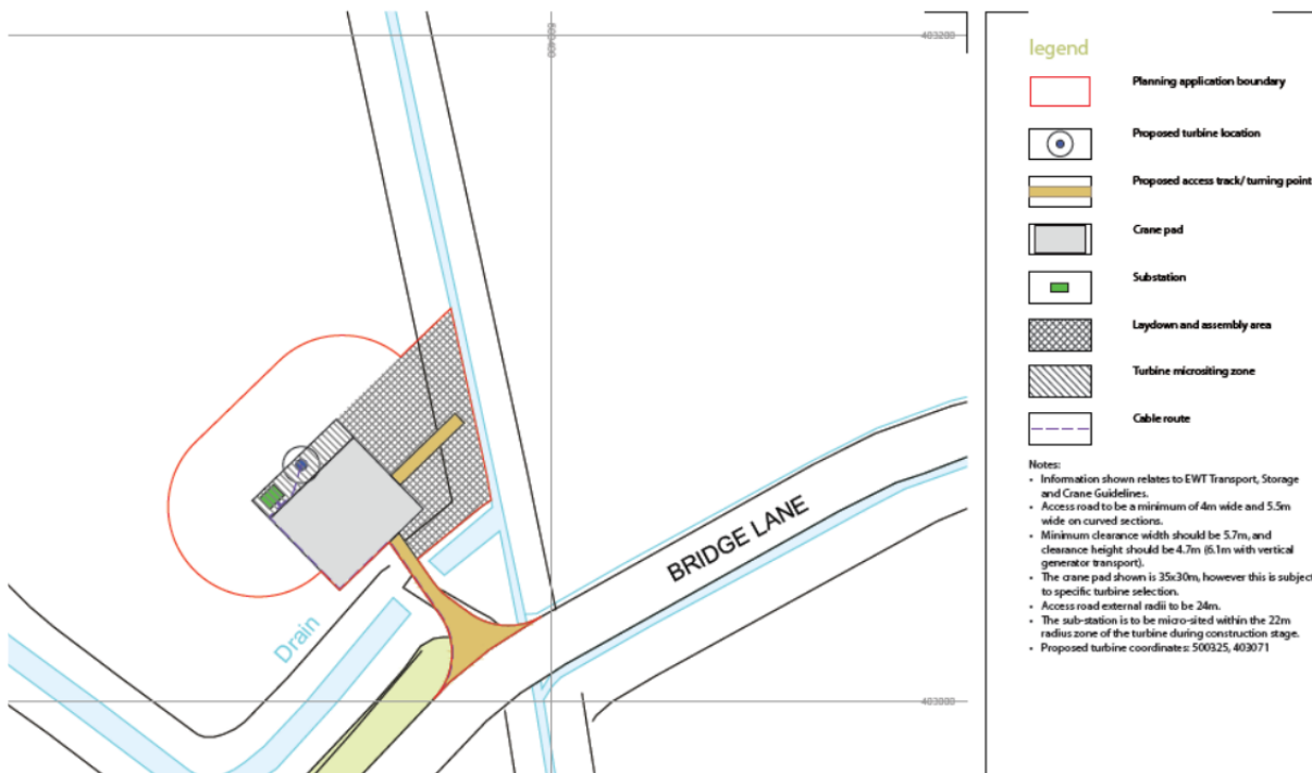
Proposed location of turbine