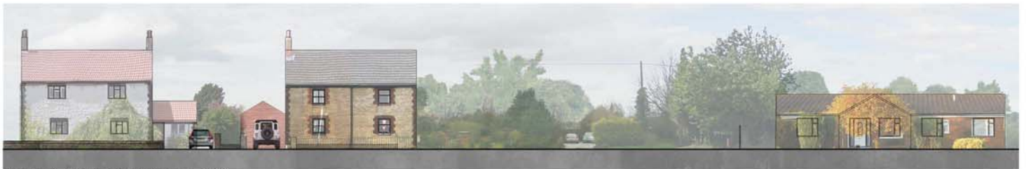
Elevation A - Existing Street Elevation - 1:200