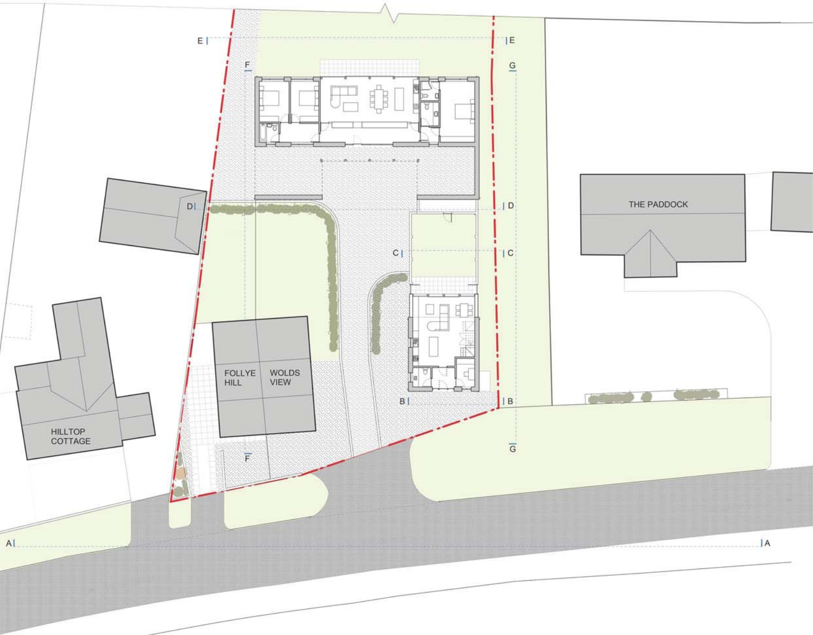
Plan - Proposed scheme -1:200