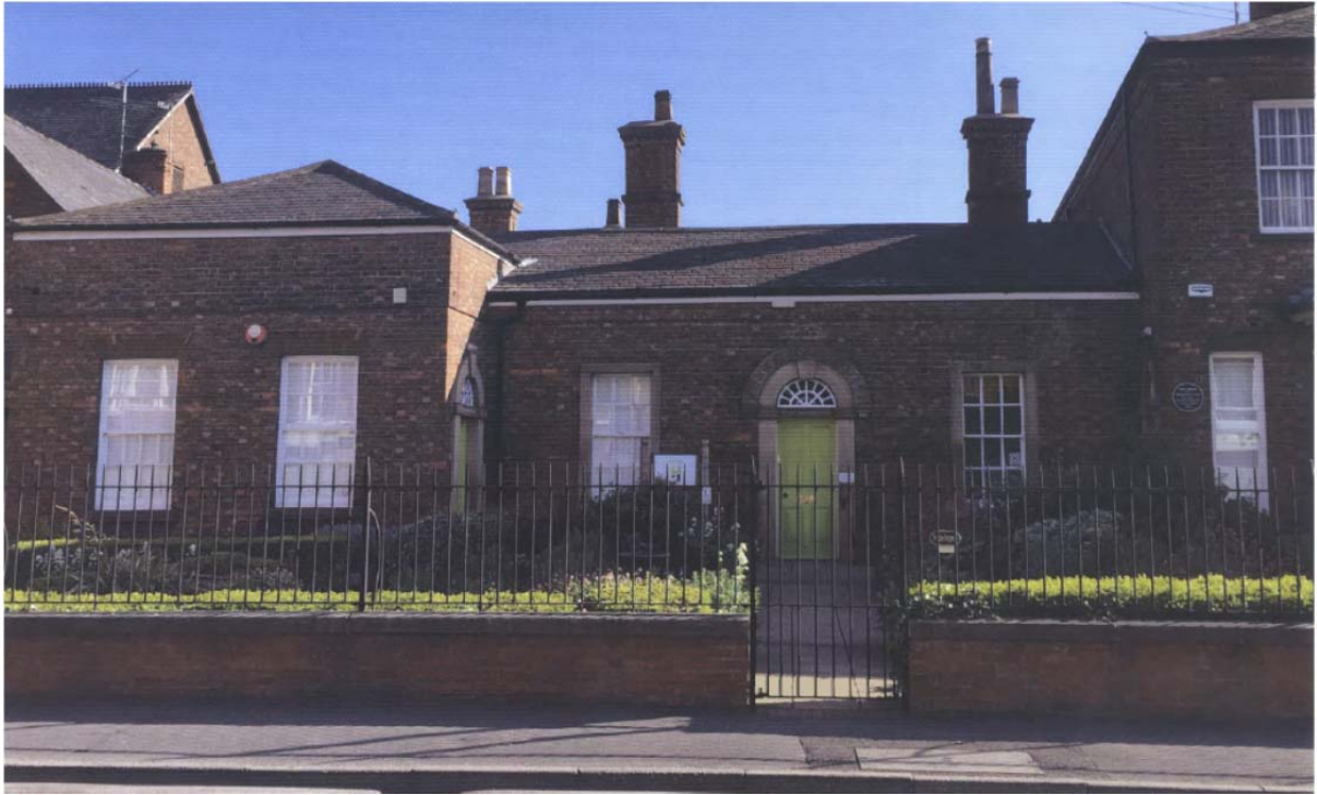
PA/2015/0658 Photographs showing green doors