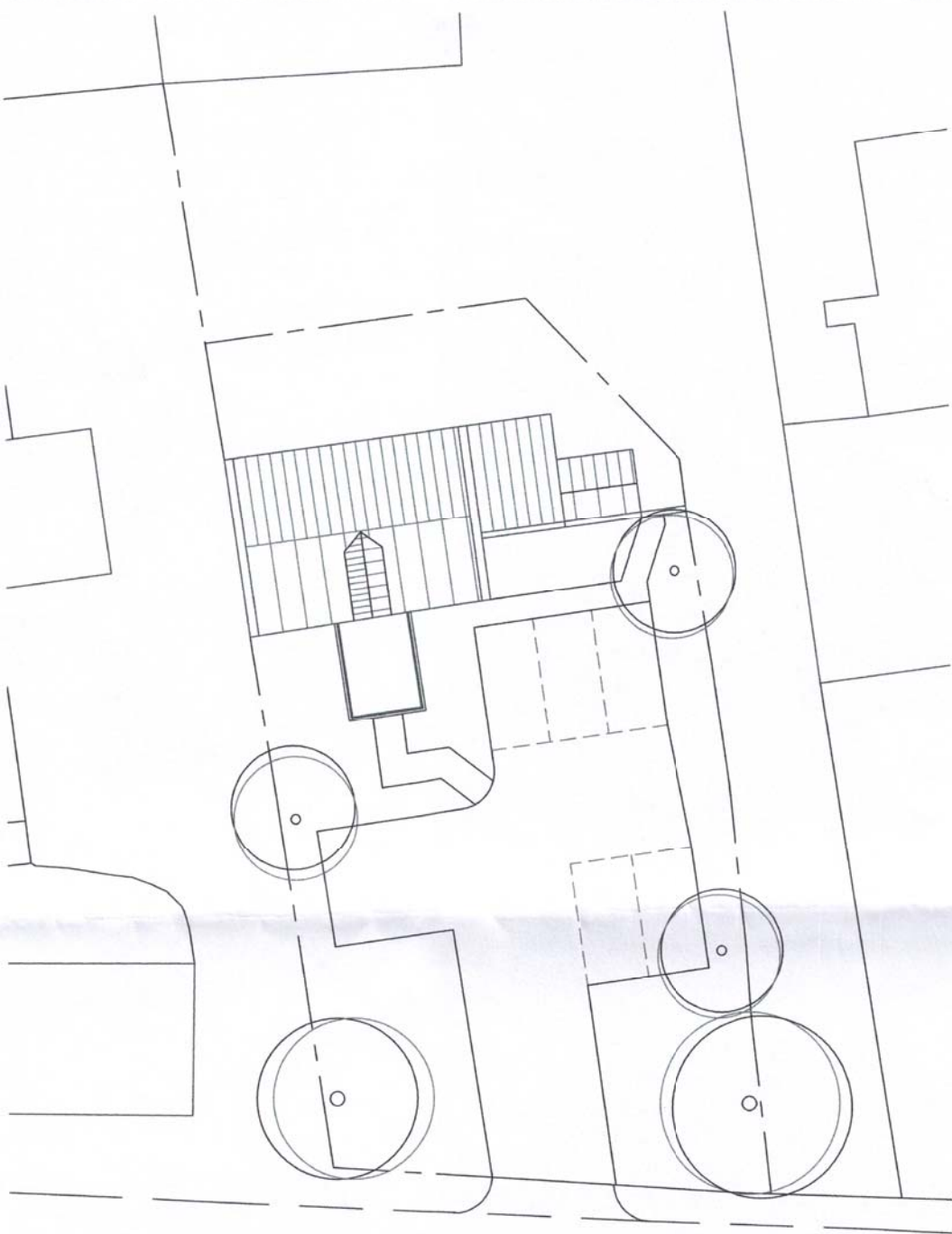
Proposed Site Layout