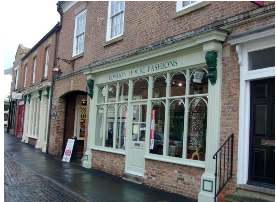
Figure 11: The successful application of heritage colours to a shop front - The use of two colours is successful but any more would be garish.

Modern colours can look harsh and should be avoided. Colour schemes adopted should be subtle and blend with the areas historic environment. Rich dark colours can look good. Pale colours or off-white, which were traditionally used on shop fronts, are also fitting. The use of one or two colours is ideal, any more and the result would be garish and confusing to the eye. It is important to consider the colour schemes of neighbouring properties to avoid unsympathetic clashes.